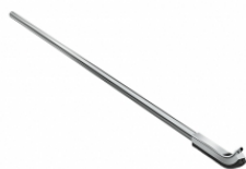
Brass Bristle Brush